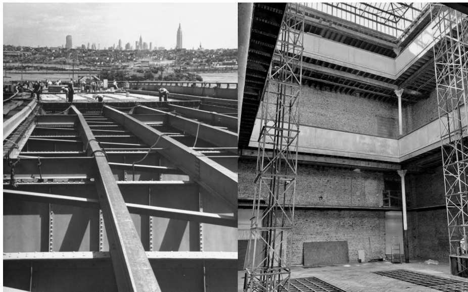
New Jersey Turnpike (1951)

Mercerie , the former warehouse of Magasin Absalon located behind Les Halles Saint-Géry in Brussels, an astonishing place for its history, architecture and immense interior volume, offers the ideal environment to approach the conditions of f this singular 1951 event.